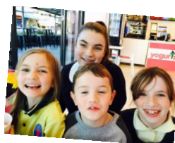
Enjoying afternoon tea!

We received some great feedback regarding Family Week. Below are just a couple of photos we thought we would share: