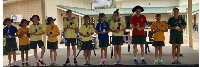
2019 Age Champions and Runners Up