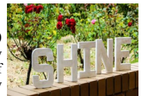
St Angela's Primary School @StAngela'sCath

Please note we have only one official Facebook page. There are no official grade Facebook pages. Please be aware some grades have formed a closed group. These pages are not to have a school crest/logo etc., as they are not endorsed, contributed to or seen by the school. As a result, there can often be inaccurate information regarding uniform changes, questions about reading levels etc. Parents are always encouraged and welcome to direct questions directly to the school. We would like to thank all the parents who continue to share such lovely, positive comments via the Facebook page, and we invite those new to our school to have a look! There is always something to see. Feel free to share, like and tag in order to spread the great work happening at our fantastic school.