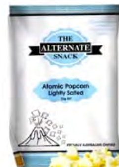
POPCORN - $0.50