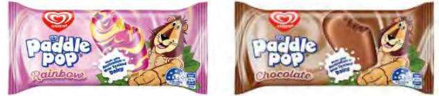
PADDLE POPS - $1.50 rainbow + chocolate