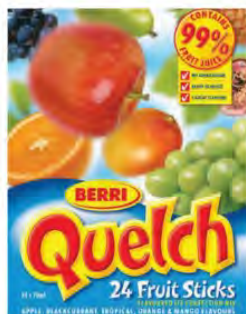
QUELCH STICK - $0.50