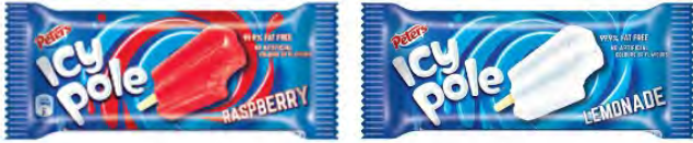
ICY POLES - $1.50 raspberry + lemonade