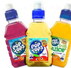
POP TOPS - $1.50 orange, apple, apple blackcurrant