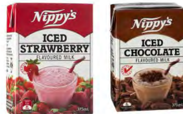
FLAVOURED MILK - $2.00