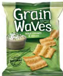
GRAIN WAVES - $1.50 sour cream + chives