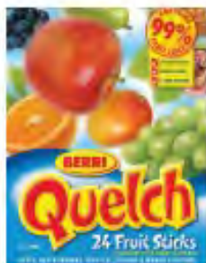
QUELCH STICK - $0.50