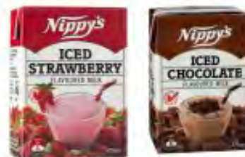
FLAVOURED MILK - $2.00