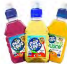
POP TOPS - $1.50 orange, apple, apple blackcurrant