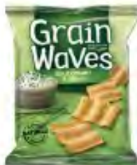
GRAIN WAVES - $1.50 sour cream + chives