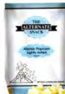
POPCORN - $0.50